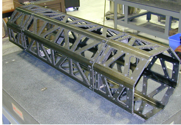
Figure 7.1.2 The pixel detector support frame. ****Placeholder****

The beryllium beam pipe [Ref] within the ATLAS detector is held on each side of the support frame by additional composite structures, the Beam Pipe Support Structure (BPSS). The BPSS also supports the Service Quarter Panels (SQP) that contain coolant pipes and all electrical services for the pixel modules [Section 6]. A low mass cable from each pixel module (Type 0 cable) is connected to the SQPs via small connectors at Patch Panel 0 (PP0 – see Figure 7.1.1). The connections to the external services for the pixel detector are made to the SQPs at Patch Panel 1 (PP1) that is at the end of the Pixel Support Tube.